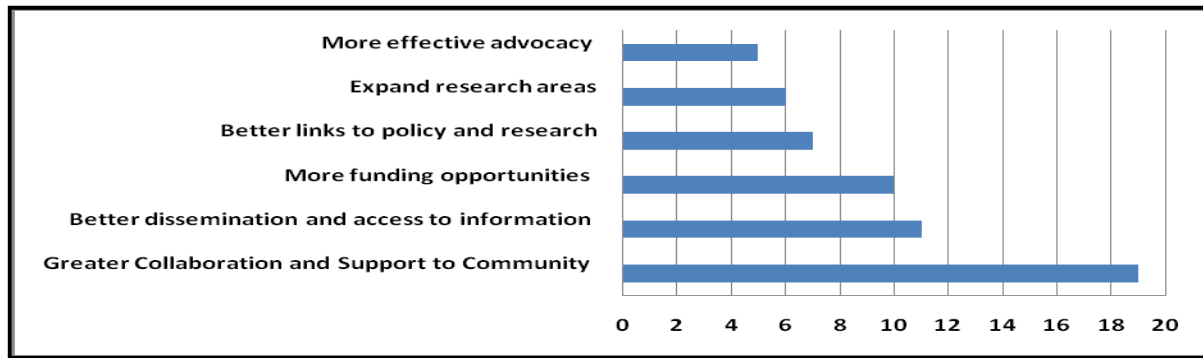
Chart 2: Challenges and/or areas for improvement. Coded themes for question 7 4

In thinking about the forming a new Centre, a dream question was posed to respondents asking, ‘ what would the ideal CERIS do? ’ 199 individuals responded with varying answers, which are organized into the top fourteen most frequently mentioned themes, in Table 7. As in the previous questions, bridging policy with academic research was among the most important.